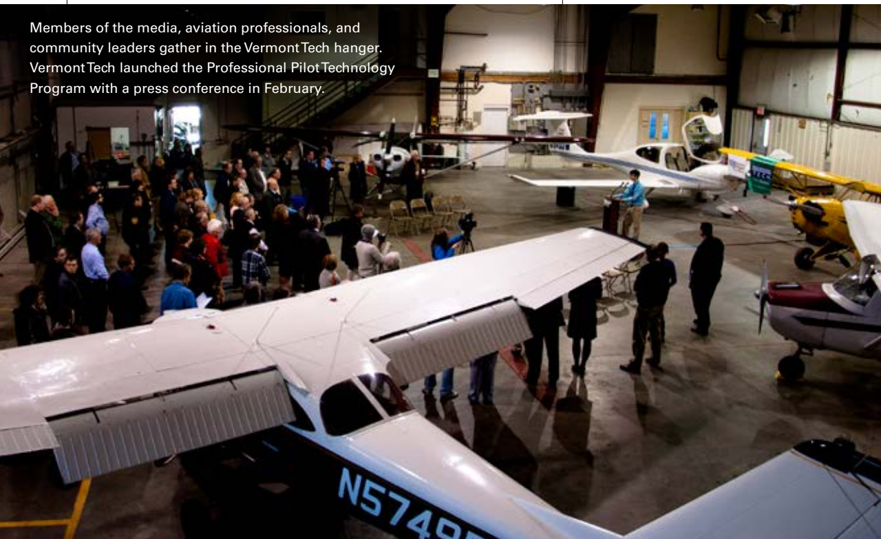
Members of the media, aviation professionals, and community leaders gather in the Vermont Tech hangar. Vermont Tech launched the Professional Pilot Technology Program with a press conference in February.